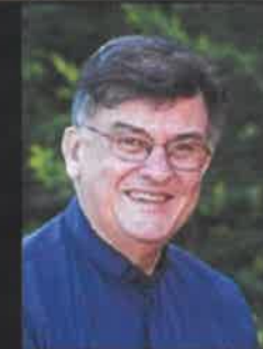
Rev Dr Lynn Arnold SA Premier 1992-93

"Whatever is proposed would be merely an initial foothold from which commercial operations would inevitably expand in coming years.